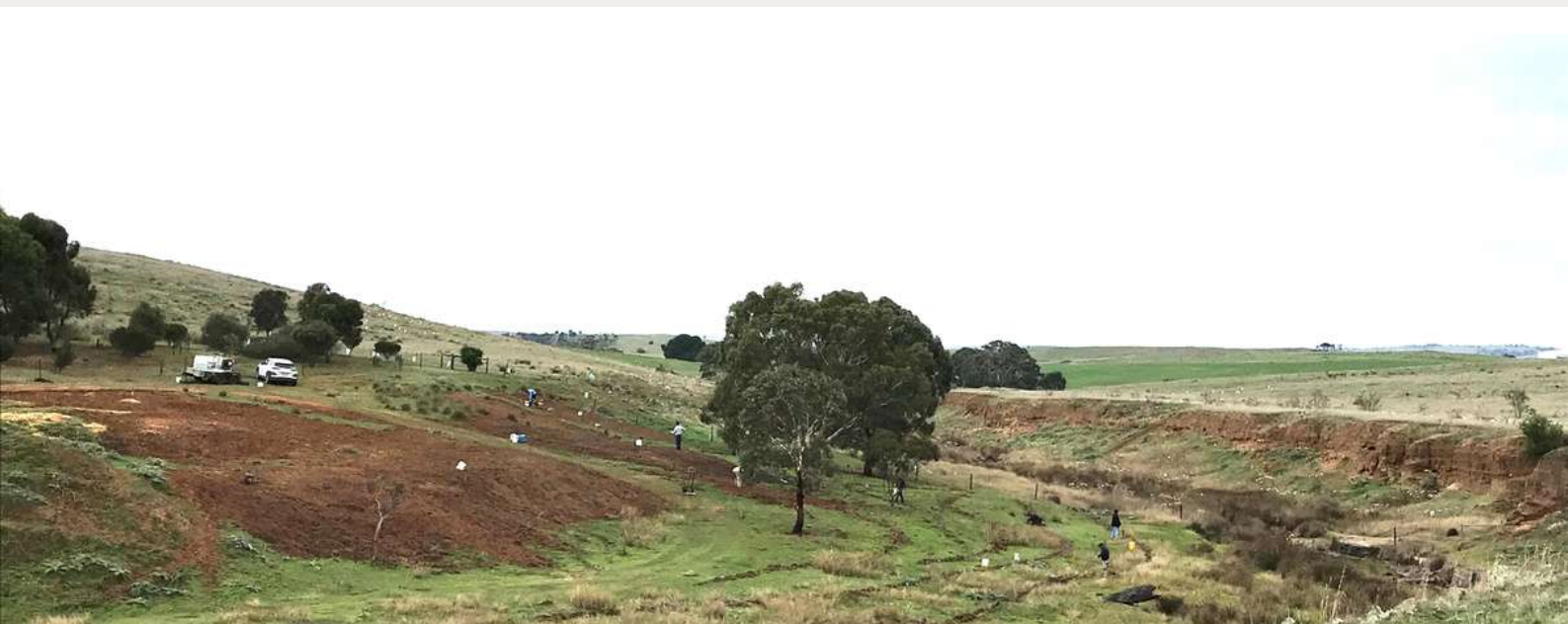
Community planting on the Bremer River in 2022.

Their Annual Community Planting sessions were also held in support of this Project, with further information sessions, planting days and grant support planned for 2024.