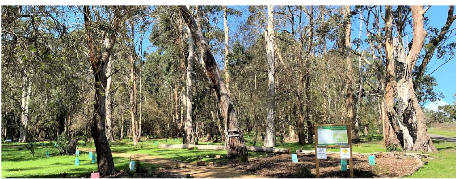
Mount Burr Trails Landcare Group working site in the state's southeast.