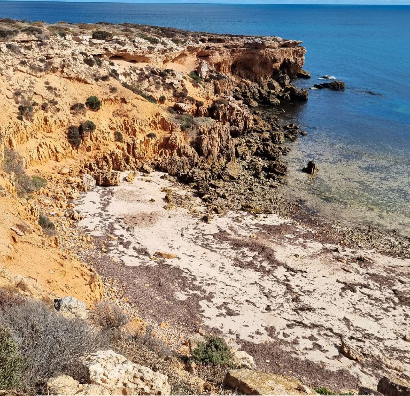
Wardang Island Indigenous Protected Area, Narungga Country.