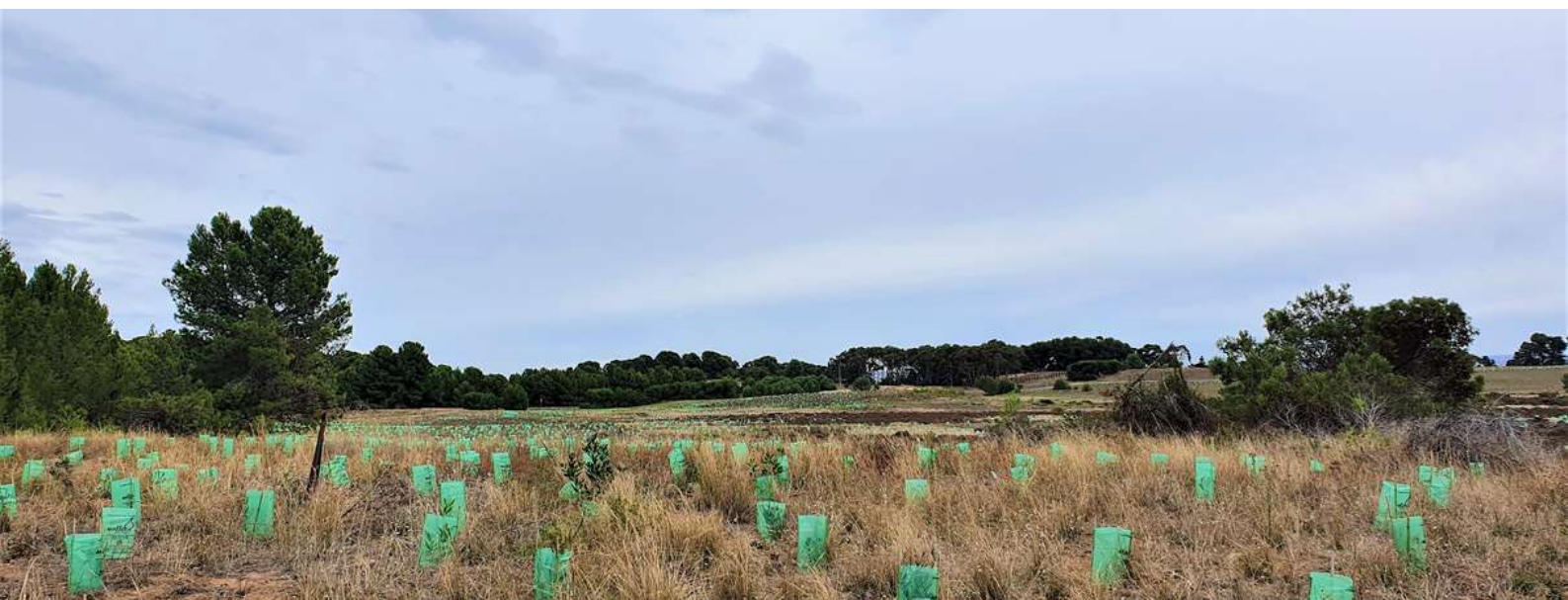
Photo: Hindmarsh Island Landcare Group planting site.

Knowledgeable – knowledge drawn from Aboriginal culture, science, community and industry.