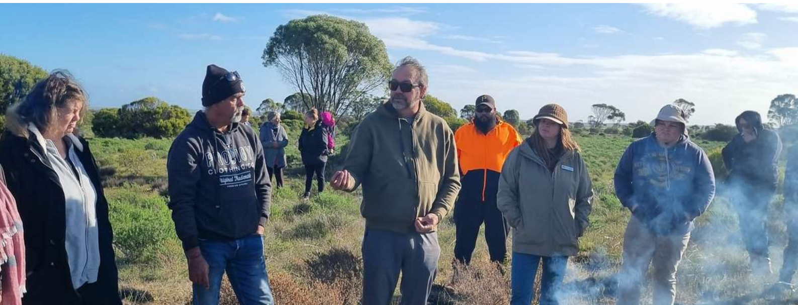
Cultural burning workshop with Firesticks Alliance and the Point Pearce community on Narungga Country.

With the formation of our new Indigenous Engagement Subcommittee, it was wonderful to connect with the Point Pearce, Raukkan and Nipapanha communities. We are proud to support the Nipapanha community in celebrating the 25th anniversary of the Nantawarrina Indigenous Protected Area in September 2023.