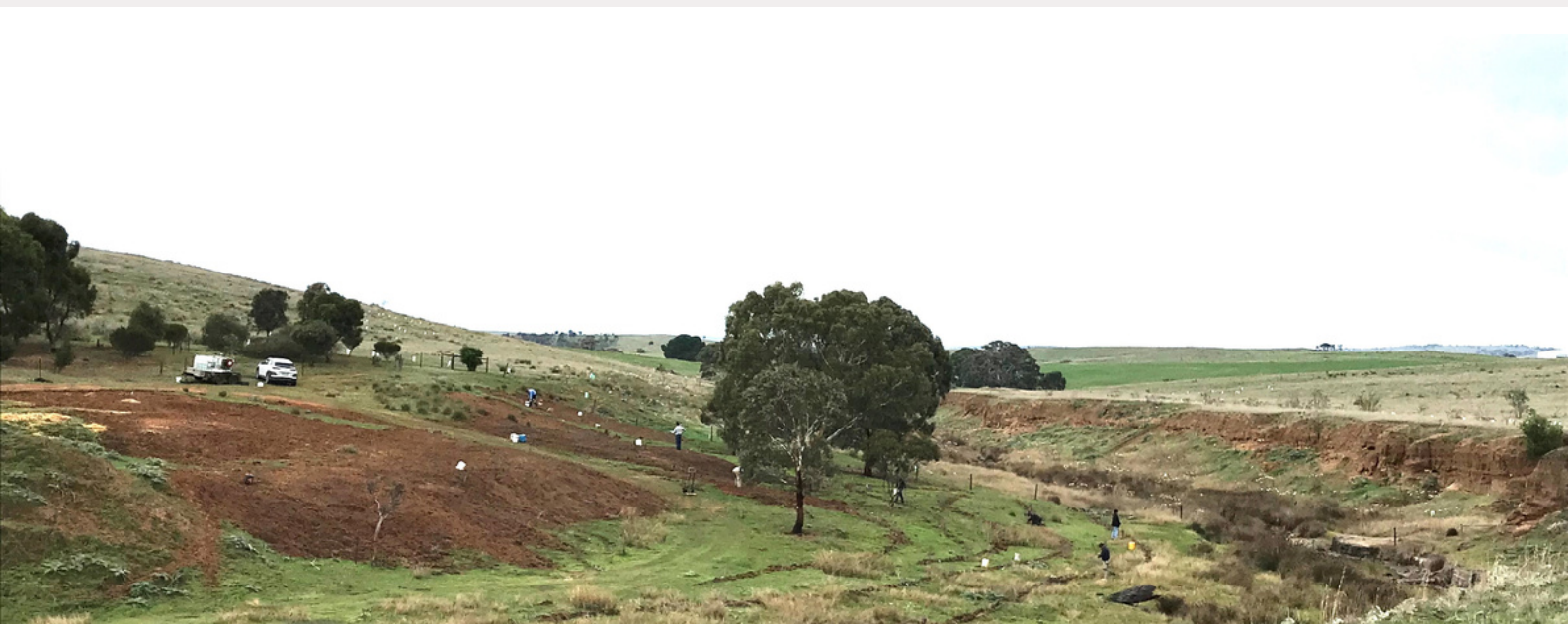
Community planting on the Bremer River in 2022.

Their Annual Community Planting sessions were also held in support of this Project, with further information sessions, planting days and grant support planned for 2024.