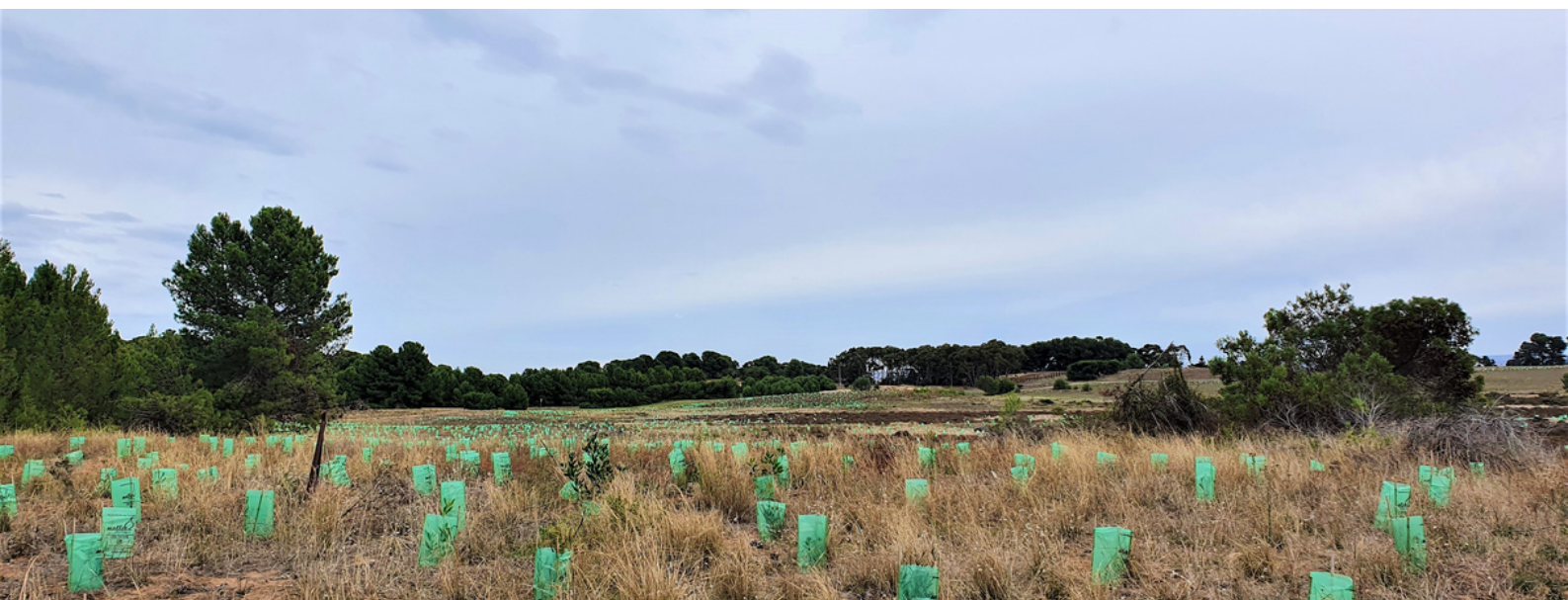
Photo: Hindmarsh Island Landcare Group planting site.

Knowledgeable – knowledge drawn from Aboriginal culture, science, community and industry.