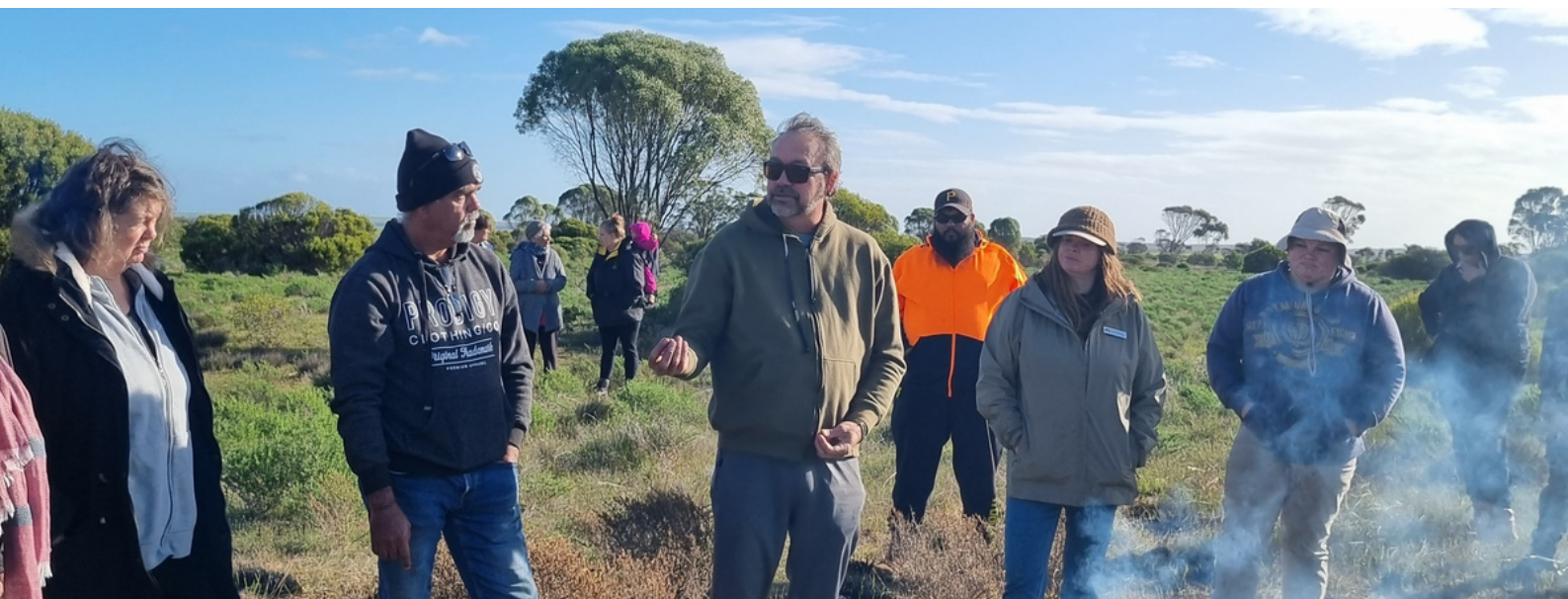
Cultural burning workshop with Firesticks Alliance and the Point Pearce community on Narungga Country. Credit: Eleanor Pratt.

With Natalia Diaz coming into a brand new role dedicated to volunteer support, we had an increased effort to visit as many members as possible, attending meetings, workshops, seminars and planting days! This has been invaluable for us to learn about your amazing projects and what support you need from us. With the formation of our new Indigenous Engagement Subcommittee, it was wonderful to connect with the Point Pearce, Raukkan and Nipapanha communities. We are proud to support the Nipapanha community in celebrating the 25th anniversary of the Nantawarrina Indigenous Protected Area in September 2023.