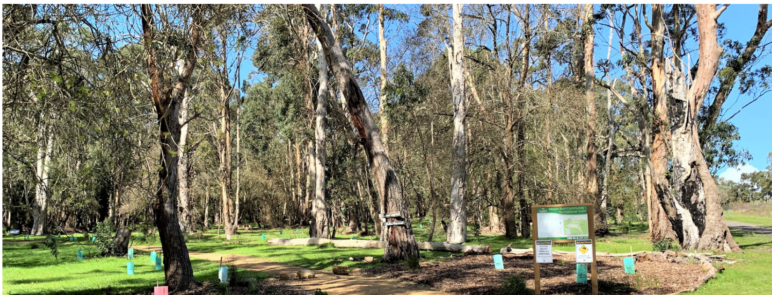
Mount Burr Trails Landcare Group working site in the state's southeast.