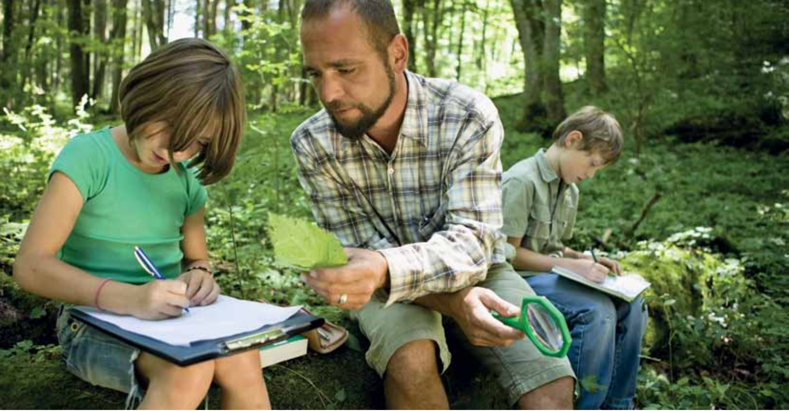
Children, the future of Australia, learn from their mentors.